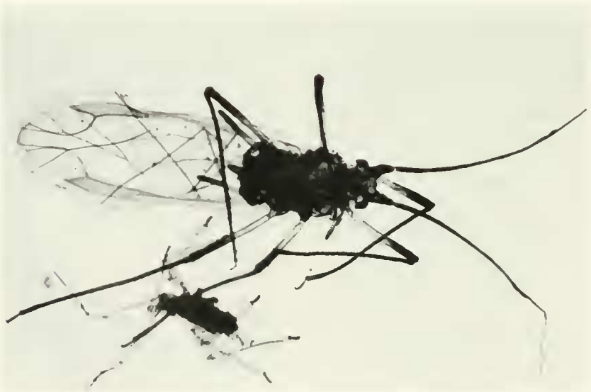
Fig. 2. Holotype of Capitophorus corambus on slide #10657, INHS (7.8 \times ).

(Sanderson) and one nymph of Chaetosiphon ( Pentatrichopus ) sp.? supporting the recorded host as rose. Photographs of the holotype and morphotype of C. corambus are shown in Figs. 2 and 3 and measurements are given in Table 1. We therefore